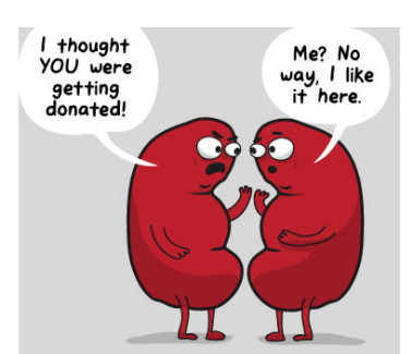
the Awkward Yeti.com